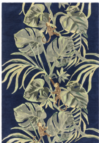
MONKEY BUSINESS INDIGO