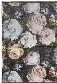
FLORETTA CHARCOAL BLUSH